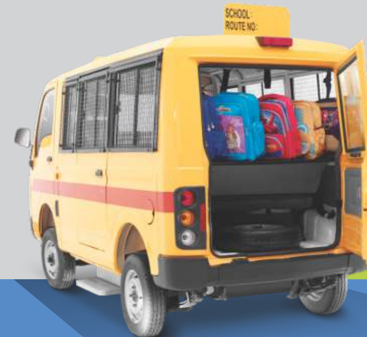
Magic School Van